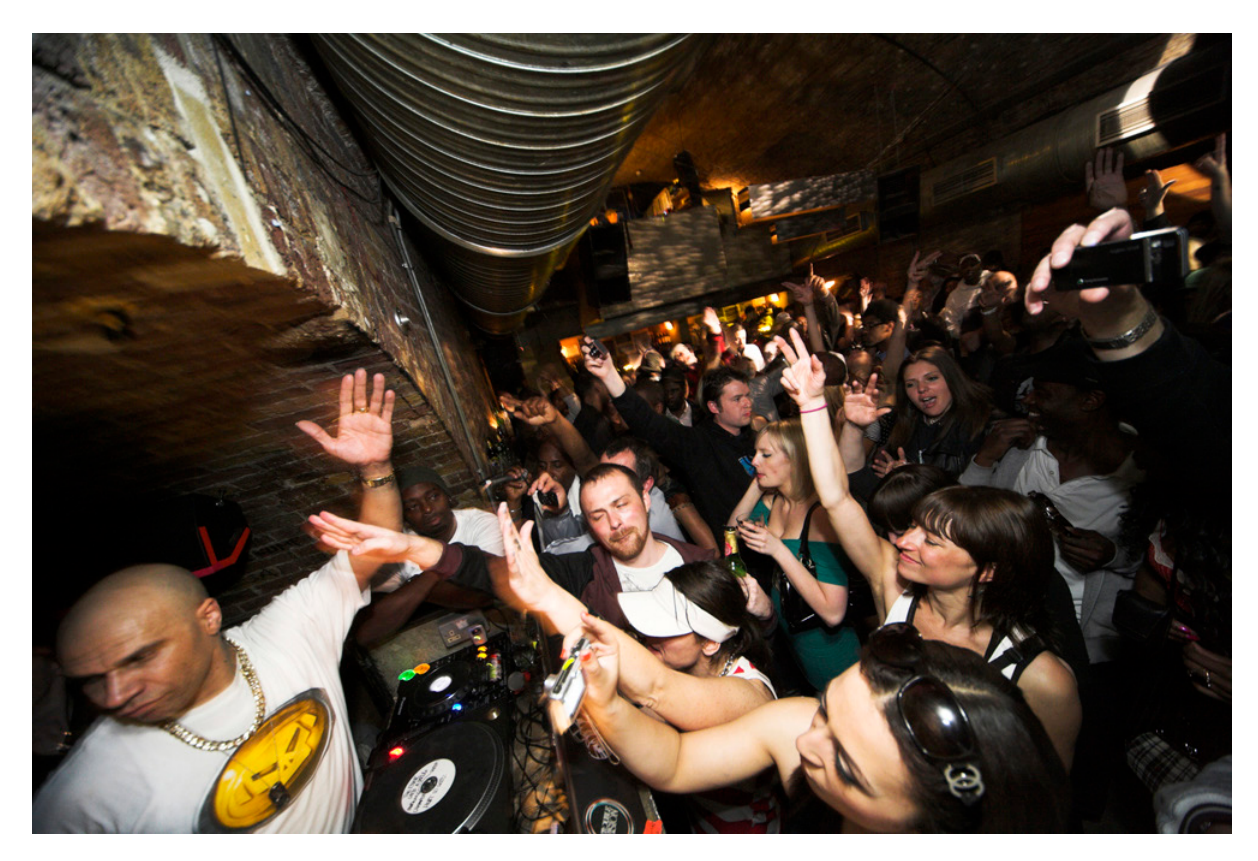
FIGURE 2. GIRL MAKING THE BO! SIGN, AT KEMISTRY MEMORIAL, MAY 2009.

Lemon D has channelled the explosive violence unleashed by the sub-bass gesture into the Amen break, cutting and splicing this sampled rhythm in such a way that the loud snare fragments undermine the dancer's internal sense of a steady 4/4 meter. Together with the impact of the bass accents, the scything, unpredictable snares have the effect of temporarily tearing the ground from beneath the dancer's feet. It is only after extended listening that one can hear patterns emerge; the bass notes occur at regular intervals, providing a structure for what seems like the spontaneous disorder of the sampled snare fragments. They signify the presence of a broader, systemic permanence to this chaos. As such, the ground-level chaos of the post-industrial city, apparently encouraged by official powers, has been shockingly articulated.