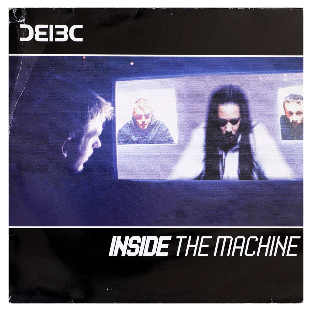
FIGURE 2: INSIDE THE MACHINE BY BAD COMPANY (2000).