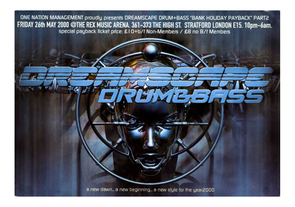
FIGURE 5: A "VAMP IN THE MACHINE" ON A FLYER FOR A DREAMSCAPE RAVE, MAY 2000.

machine", designed to seduce the insurgent proletariat into submission (Huyssen 1982). Similarly, Rietveld shows that Maria's purpose is to "normalise the male experience of new technology" (2004: 56). Huyssen argues that the "fears and perceptual anxieties emanating from ever more powerful machines are recast and reconstituted in terms of the fear of female sexuality, reflecting, in the Freudian account, the male's castration anxiety" (1982: 226). Thereby, technological fetishisation enables the social "castration" of male labour power to be mitigated by investing technological culture with the "naturalness" of female sexuality.<sup>17</sup> In drum 'n' bass culture, technology is also often fetishised in terms of the female body's urban uncanniness; she is imagined as a reproductive machine that has castrated male labour from its "natural" position of power in industrial society. On dance event flyers and record sleeves, mechanical vamps are often situated in post-apocalyptic imagery of the city derived from dystopian science fiction films like Blade Runner . In this way, she briefly resolves male castration anxiety—both in the immediate, post-industrial context and in the deeper, psychological sense—through a return to the fullness of the chora as the original "home", thereby seeming to "complete" the mother's own castrated body.