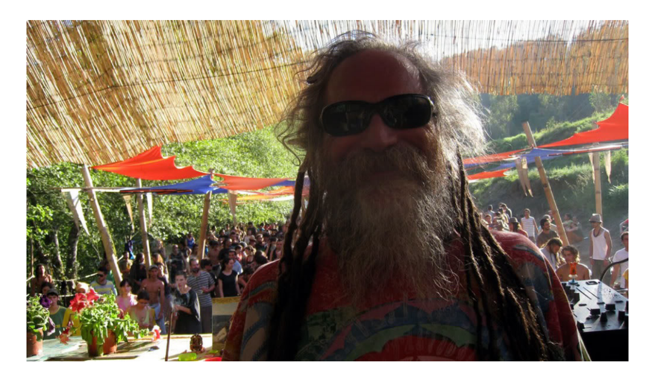
Figure 13. Goa Gil party. Portugal, 2008.

yet (charged) alive, the zombie is a liminal figure emblematic of the altered conditions of mind and flesh experienced as "trance". Anaesthetized yet mobilized all the same, the zombie embodies the unpredictable yet potentially transcendent and revitalizing conditions of the dance floor.