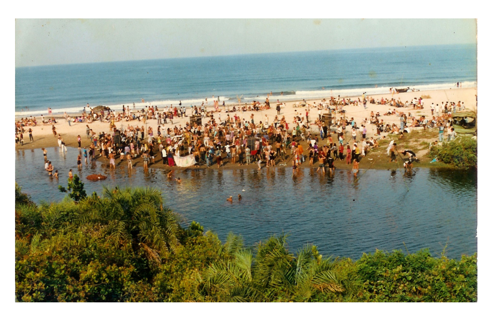
Figure 6. Party at Arambol, 1991.

mankind has used music and dance to commune with the Spirit of Nature and the Spirit of the Universe". Within the Goa trance dance which Gil fashions as a "ritual" more than a "party", "we go beyond thought, beyond mind, and beyond our own individuality, become One in the Divine Ecstasy of union with the Cosmic Spirit". Under Gil's guidance, dance ecstasy is purposeful, initiatory. For Gil, and his many followers the world over, dance is regarded as a technique of "active meditation", enabling actors to access the divine truth, revealing their own relationship with the cosmos ( Freeze Magazine 2001). Interviewed by McAteer (2002: 47), Gil stated that as an outcome of this experience it becomes evident that " all life forms are existing from this Spirit, and, you know, we're a part of that thing and we have to protect that thing". In an echo of perennial mystical idealism, the trance dance experience is fantasised to assist participants to "become more sensitive and aware of themselves, their surroundings, the crossroads of humanity and the needs of the planet. With that awareness comes understanding and compassion. That is the need of the hour and the true Goa Spirit".