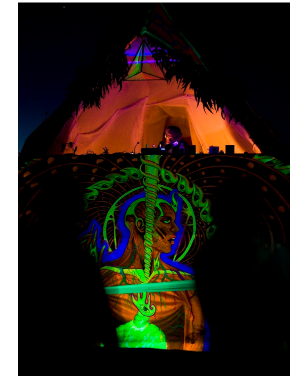
Figure 14. Goa Gil party, Chile, 13 November 2010.<sup>40</sup>

This article has shown that Goa Gil manifests as a polyvalent symbol for participants in the psychedelic diaspora and is iconic among proponents and detractors of "psytrance" and "darkpsy" alike. For those initiates who have regarded psychedelic trance as a vehicle of hope and peace, Gil—who is heir not only to the Haight-Ashbury psychedelic scene of the 1960s, but to ancient mystical and ecstatic cults, the connections with which are both sanctioned and nebulous—possesses the right stuff. For others, the failure of Goa trance to meet its millenarian promise has generated heated reactions, both from within and outside of the scene, with detractors charging psytrance as a hubristic behemoth that has collapsed under the weight of its own contradictions. Gil is ultimately iconic of tensions within a diverse movement, tensions which I expand upon elsewhere (see St John, Forthcoming). Loved as a champion of the Goa vibe, and loathed as symbol of the contradictions that have befallen it, Gil pitches like a weather balloon in a storm. But Gil, who will turn 60 in 2011, stands fast over 40 years since he first set foot on Anjuna beach. And the question of whether he is venerable or reproachable may never be finally settled—for that is the fate of anomalies.