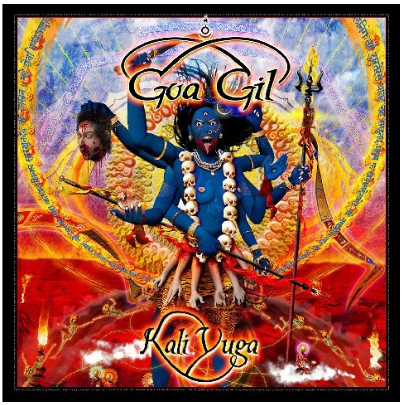
FIGURE 11. COVER ARTWORK ON GOA GIL'S COMPILATION KALI YUGA (2009).

Kali does the Dance, the Dance of Destruction. Shiva lays down, to watch the action.