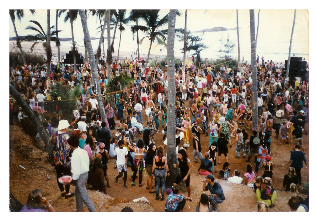
Figure 5. Party at South Anjuna Beach, 1991.