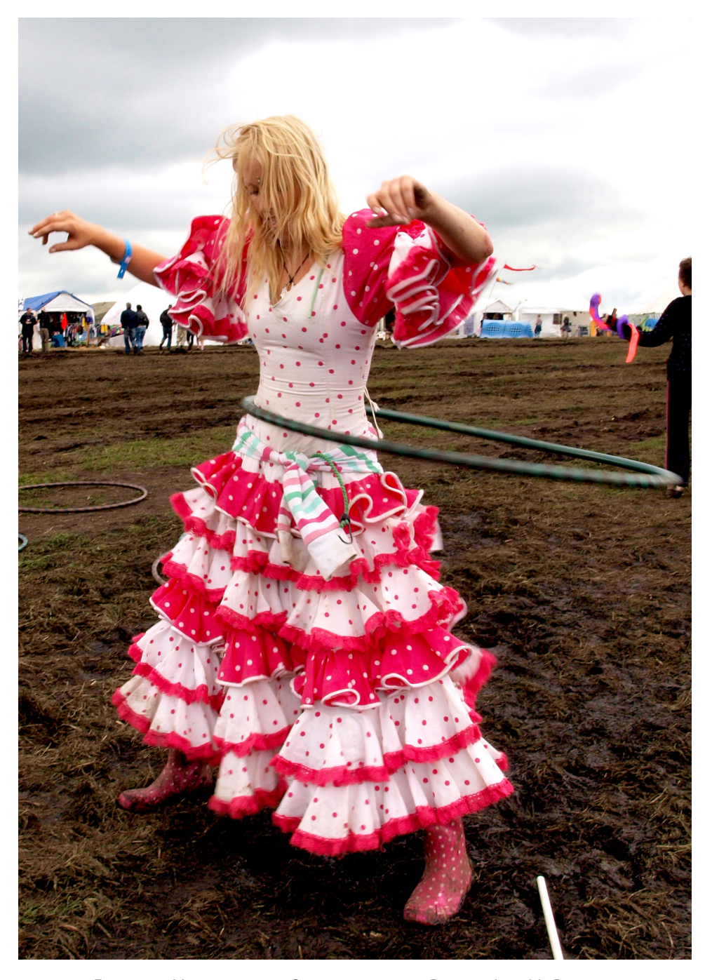
FIGURE 3. HOOP PLAY AT SHAMANIA 2008.

walkabout performance or finely-rehearsed stage shows that all contribute to the highly visual terrain of the party. Instances of play associated with improvisation, looseness, and freewheeling include more inclusive forms of social and ecstatic dancing, trance, the play of multiple social interactions and Bey's notion of "radical conviviality" (1994). Other forms of play more associated with the theatrical world can be seen in participants' use of