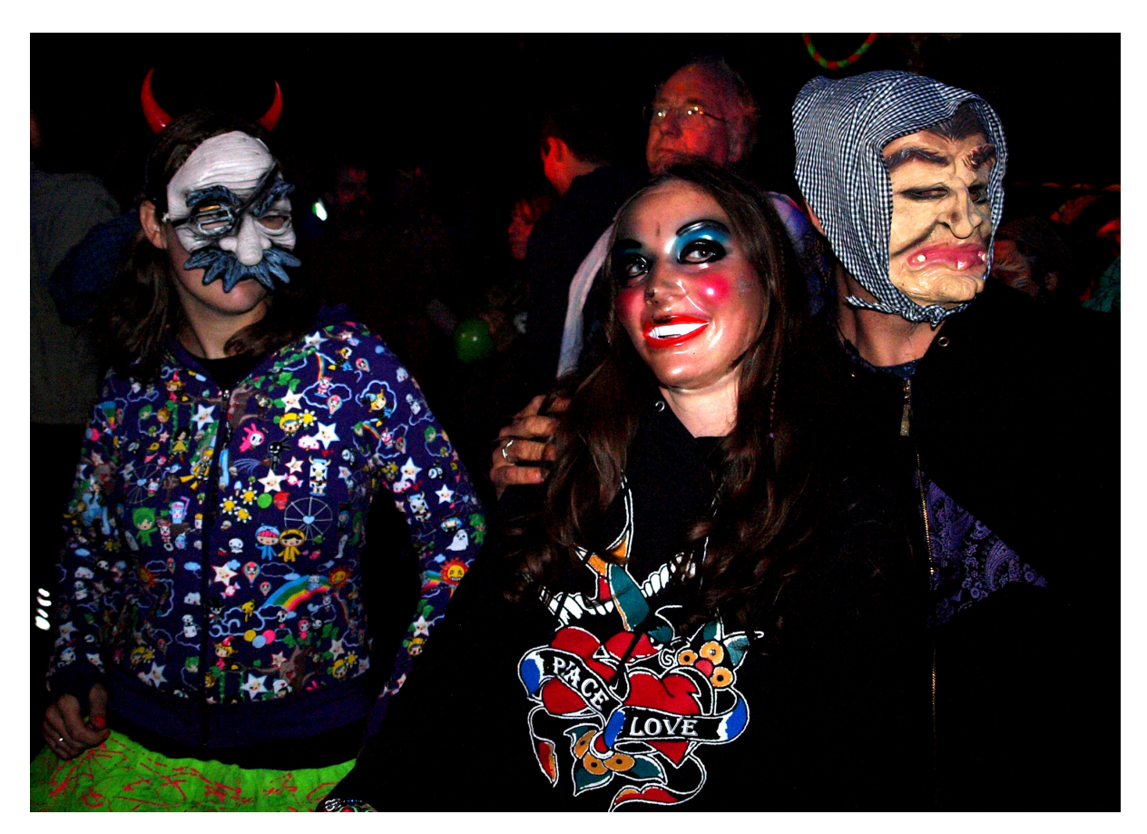
FIGURE 2. MASKED FESTIVALGOERS AT SHAMANIA 2008.