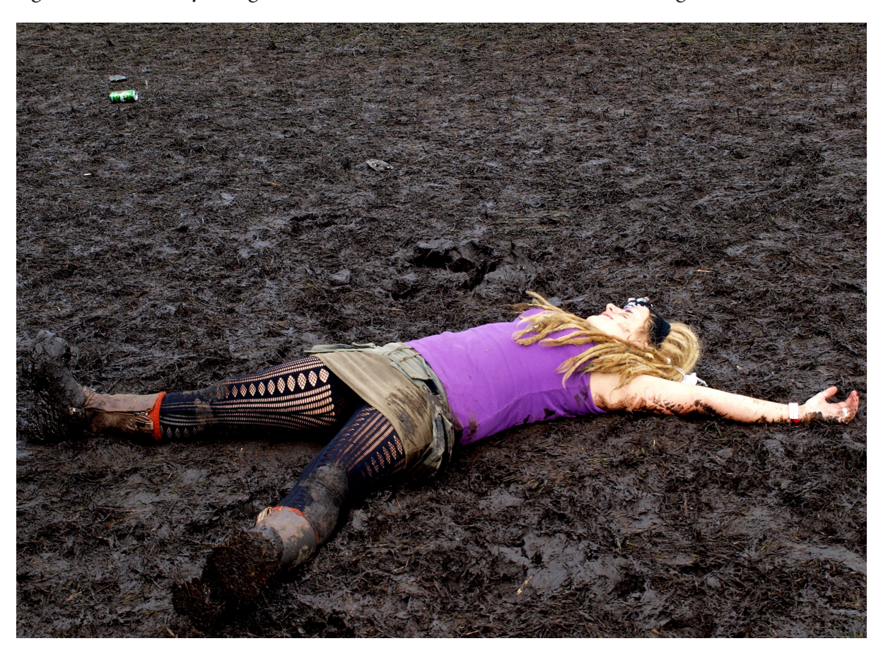
FIGURE 1. FESTIVALGOER IN MUD AT SHAMANIA 2008.

being inherently slippery as a term, play is also ambivalent in its application. Play can be frivolous and useful, trivial and meaningful, progressive and regressive simultaneously. The same ambivalence is inherent in underground club culture. Playing and raving can function simultaneously as escape from daily life and as confrontation of reality. Play in the context of the underground party can often be light, theatrical, spectacular, fun and socially engaging. At the same time it can be dark, subversive, disturbing, disorientating and potentially fatal, particularly in relation to the risks associated with drug experimentation, sleep deprivation, heat exhaustion and so on. In this instance I have drawn polar extremes of light and dark, positive and negative characteristics that sit in apparent opposition to each other, but play does not sit comfortably in neat binaries such as these. Like the "joker in the neuroanthropological pack" (Turner 1983: 233), play slides between categories and has no difficulty adopting dual positions. For example, play can be both fun and dangerous simultaneously. Indeed, the fun is often in the danger. Within the underground dance scene, it could be argued, play is ultimately characterised by the co-presence and intertwining of light and dark. Play recognises and revels in the inbetweenness of things.