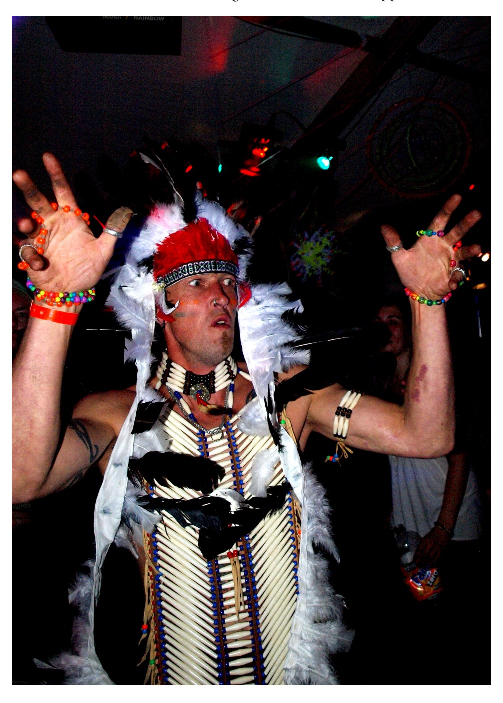
FIGURE 4. COSTUMED DANCER AT SHAMANIA 2008.

Rather than functioning as a ritual stage of transition where initiands move from one social status to another, the liminal culture of psytrance offers an in-between space of permanent impermanence (St John 2010: 228) which one can revisit and inhabit at will as a diversion, a pastime or a socio-cultural tactic that might have "real world" applications.