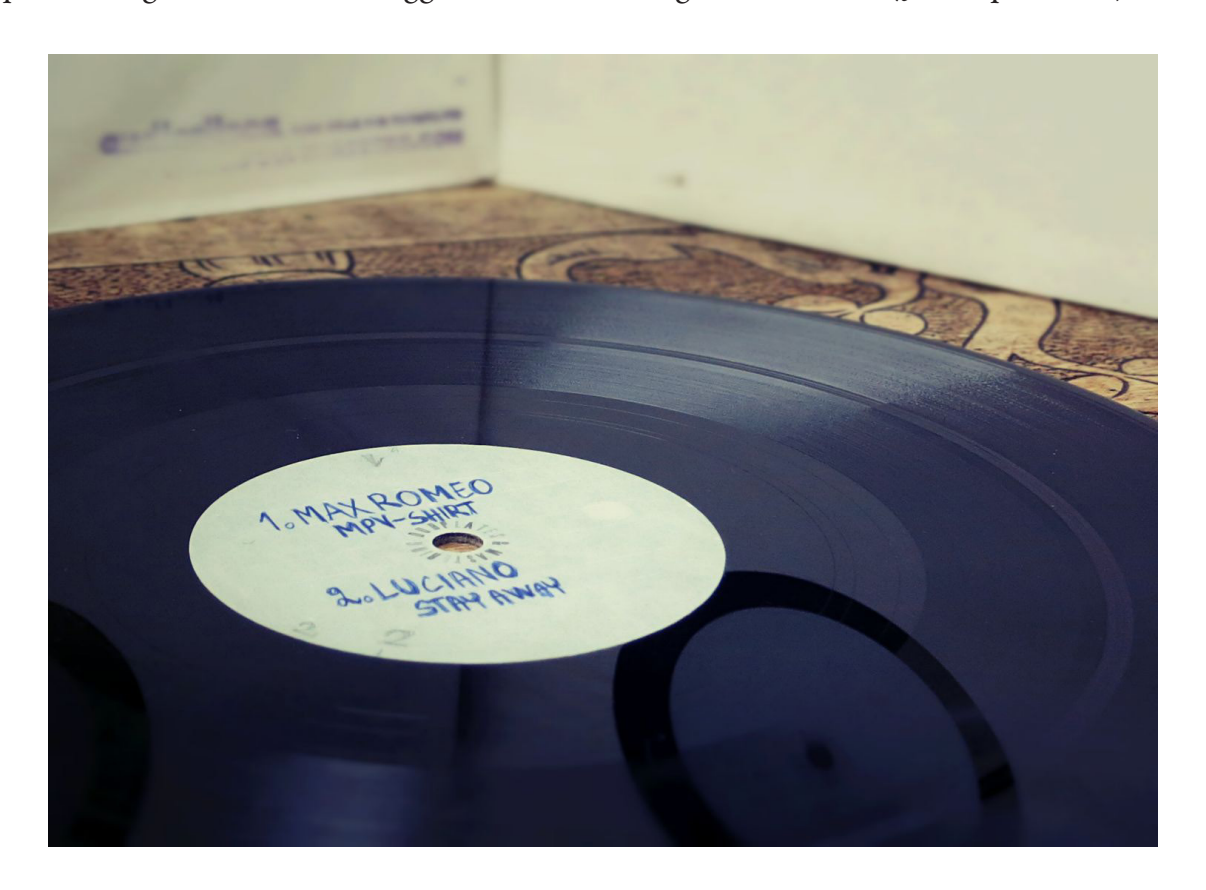
FIGURE 1. 10-INCH ACETATE DISC FEATURING THE DUBPLATE SPECIAL OF MAX ROMEO'S "CHASE THE DEVIL", COMMISSIONED BY MPV SOUND.

"Chase the Devil" is one of the many dubplate specials MPV has commissioned (see fig. 1). It is worth noting that, since 2005, MPV has been performing less as a sound system. Nestori, who does not not work full time in the music industry, has more recently been performing with the "roots reggae" oriented Intergalaktik Sound (Järvenpää 2014). The