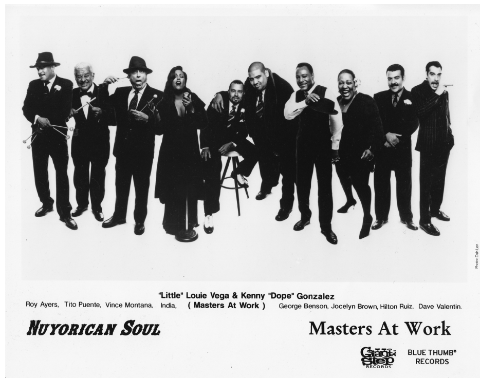
FIGURE 3: NUYORICAN SOUL LED BY "LITTLE" LOUIE VEGA AND KENNY "DOPE" GONZALEZ