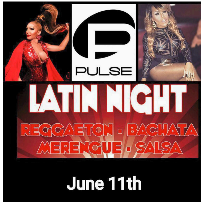
FIGURE 2: FLYER FOR THE SATURDAY NIGHT PARTY AT PULSE ON 11 JUNE 2016.

and mess up her kitchen with your hunger. Maybe your Tia dropped you off, gave you cab money home. Maybe you had to get a sitter. Maybe you’ve yet to come out to your family at all, or maybe your family kicked you out years ago”.