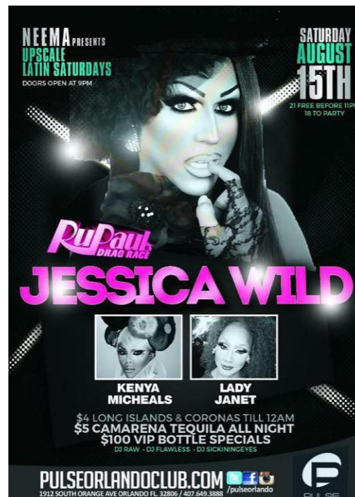
FIGURE 1: FLYER FOR PULSE’S SATURDAY NIGHT PARTIES.

The everyday homophobia and racism experienced by queer people of colour offers a more obvious explanatory context for Mateen’s actions than any last-minute declaration of sympathy for Isis. There have, of course, been gains in the US in recent years, including the Supreme Court June ruling in Obergefell v. Hodges that effectively made same-sex marriage the law of the land, the White House LGBTQ pride reception where transgender